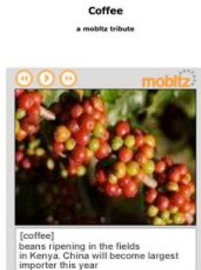
Figure 1. Mobltz player – can be embedded in any web site. The player cycles through an unlimited number of media contributions. People contribute by sending an MMS with the keyword [e.g., coffee].

Finally, Mobltz provides functionalities to broadcast conversations or ideas globally, calling on anyone anywhere to contribute and participate via media submissions. While any moblt can be embedded in any web site (see Figure 1), when a user “opens” a moblt to public participation, that moblt will continue to accept submissions and grow over time. This launches a massive media snowball—a set of media relationships to grow via social networks (see Figure 2). Media sent via MMS or email appears automatically in the embedded moblt. For example, environmental studies students published a “soil erosion” moblt to which anyone can submit images, video or audio related to soil erosion. The result is an evolving multimedia collection that endures and grows, fueling a rich online conversation on erosion.